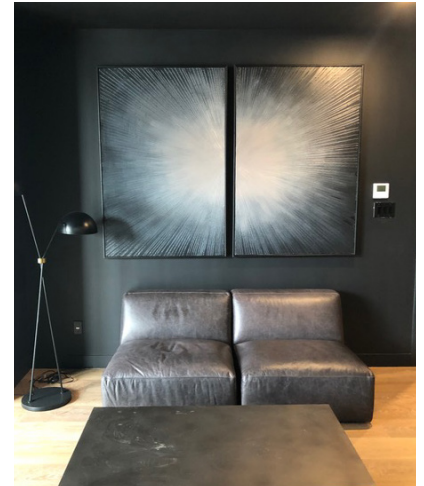
Two more lounges are being added to the mix.